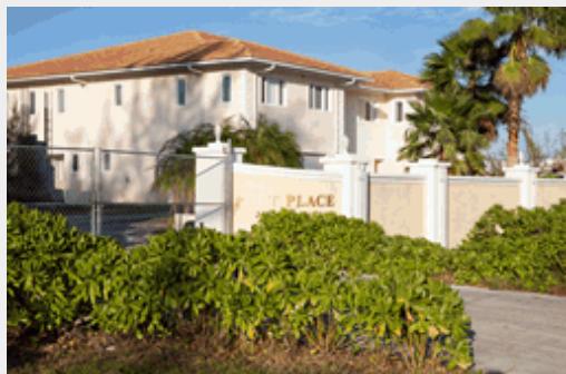
3000 Sq ft refurbished Canal front Condo now $275,000 in Freeport GB