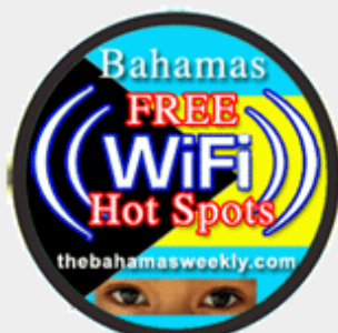
FREE Wifi Hot spots in The Bahamas